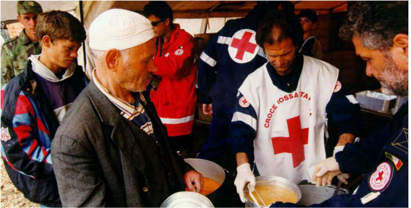
Albanian Red Cross volunteers provides hot meal to Kosovar refugees in a camp set in Kukës

The IFRC supported the Albanian Red Cross in providing relief assistance to migrants in Babrru.